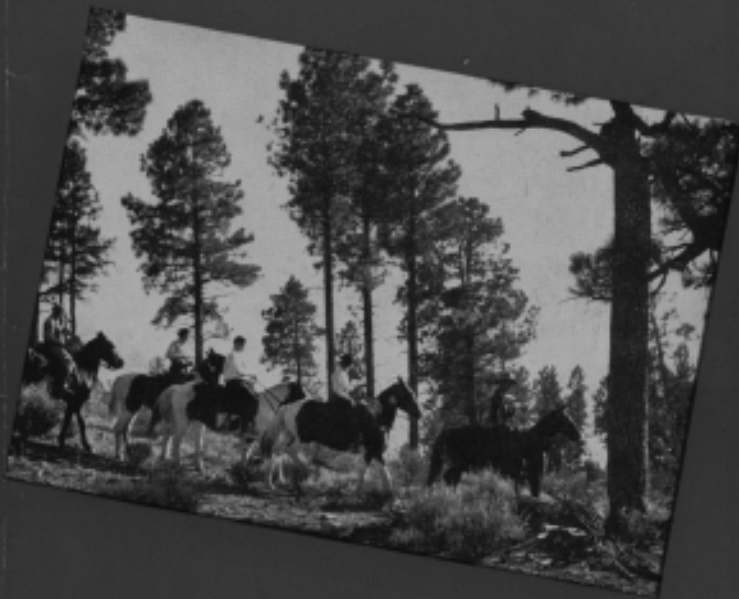
And there are many picturesque bridle paths through the pine forest along the Canyon's rim.