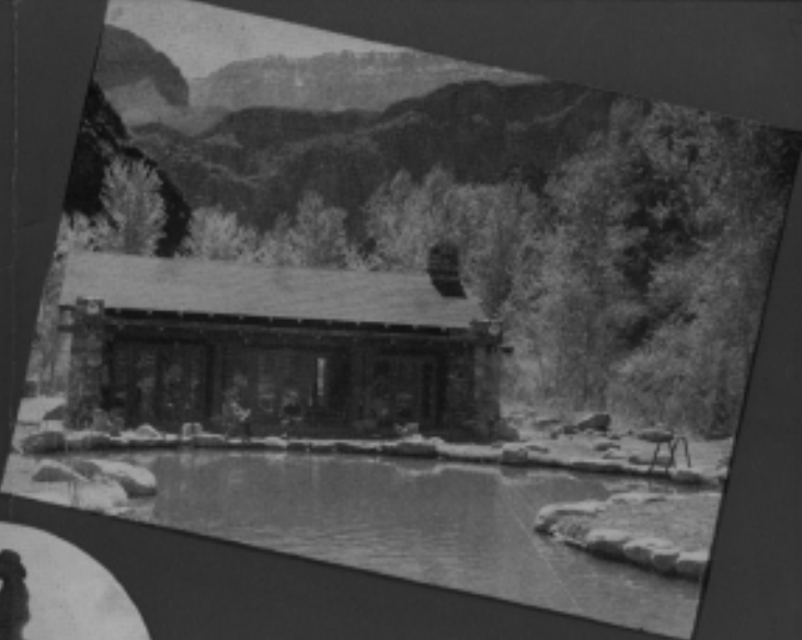
A vertical mile below the Canyon's Rim lies Phantom Ranch, with its rustic cabins and crystal-clear swimming pool.