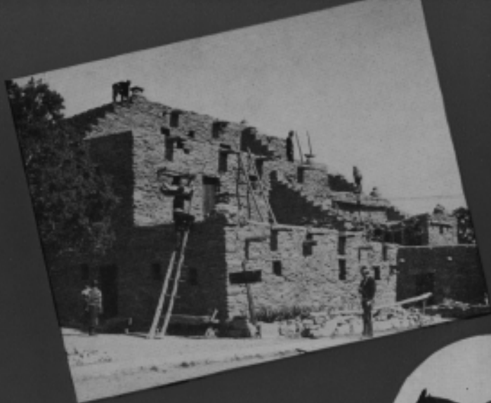
Near El Tovar Hotel and Bright Angel Lodge is the Hopi House, with its interesting glimpses of Indian life.