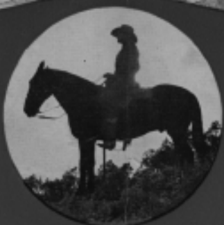
Your guide on never-to-be-forgotten rides.