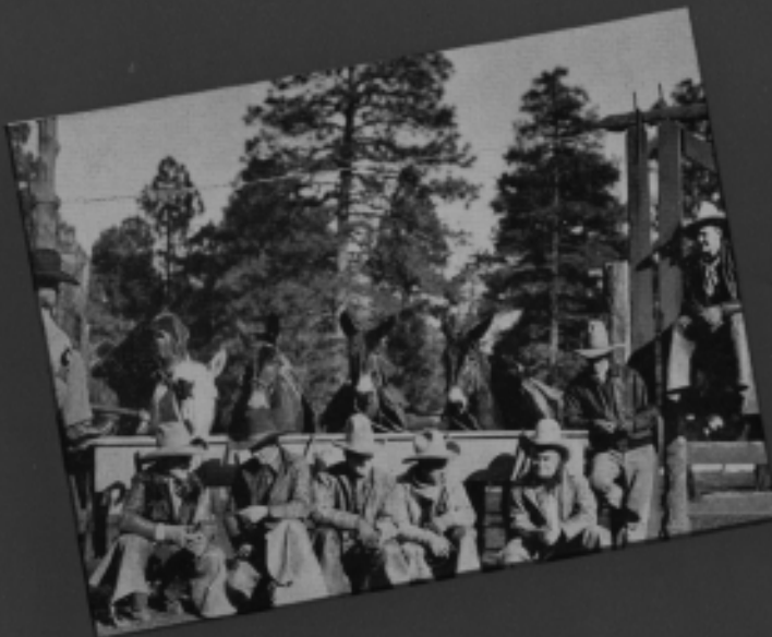
Cowboy - guides and the famous "Grand Canyon mules" are ready to take you on thrilling trail trips.