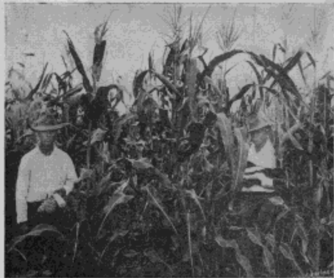
CAN YOU BEAT THIS CORN?

Remember that every cent of cost is to be paid back by the settlers on the watered lands --that this cost is secured by liens on the land itself--that the Dam will also develop cheap electric power for towns and industries, which will produce an annual revenue to aid in the repayment. We'd gladly build this Dam ourselves, through private capital, were it not for the Indian and Governmental lands and interests, for this county of Arizona led all counties in the 12th Federal Reserve District in