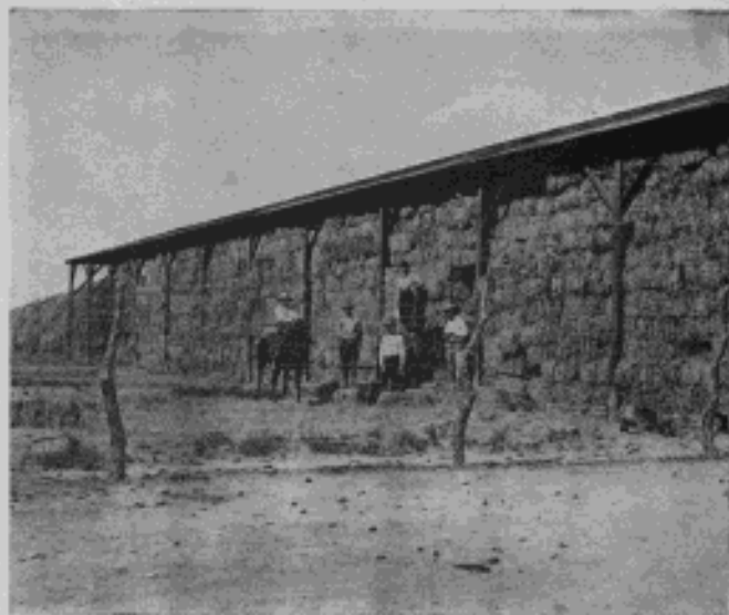
A SEASON'S BALING OF ALFALFA FROM JUST ONE FIELD