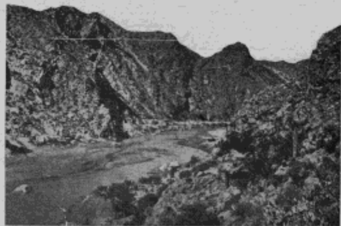
WHERE THEY'LL BUILD THE DAM

Will you please send us the replies made to your appeals to Washington? Thank you.