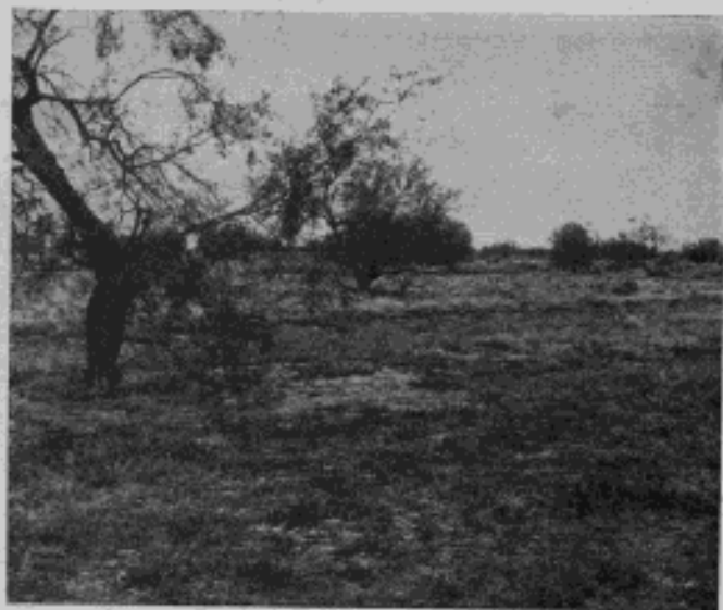
BARREN TODAY — FRUITFUL TOMORROW