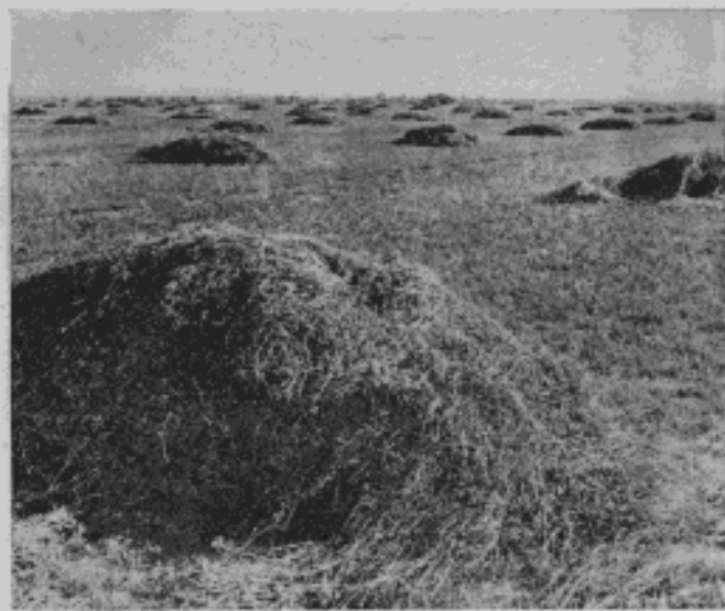
SIX TO EIGHT CUTTINGS OF ALFALFA THE YEAR

is peculiar. For many years, numerous engineers, including those of the U. S. Army, have made surveys and recommended that a storage dam be built at San Carlos. Starting with earlier plans for a 150 foot dam, the project has been so developed that now a dam of 250 feet is being considered by the Reclamation Service, that branch of your Government charged with the helpful work of reclaiming the waste lands and making them productive. A dam of 180 feet would store sufficient water for 100,000 acres, while one of 220 feet would impound 1,335,926 acre-feet of fertilizing, life-giving water. Is that worth while to the Nation?