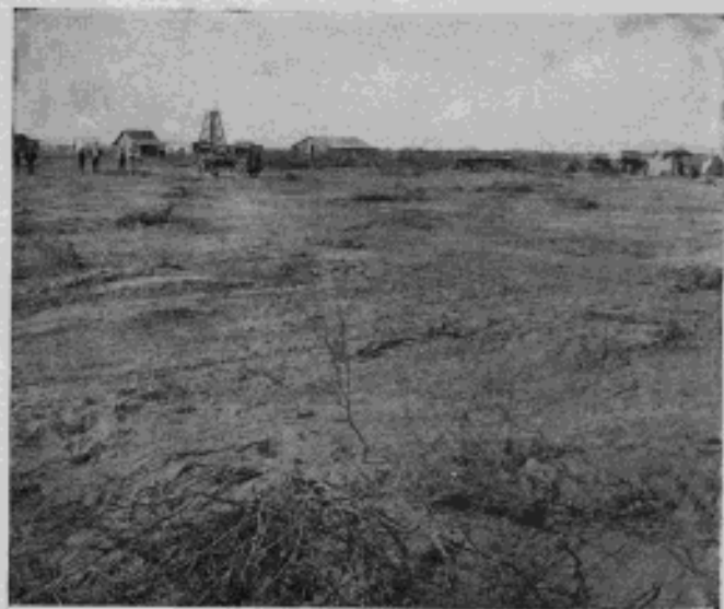
CLEARING THE DESERT

And yet, despite the wonderful productivity of our soils, but a few thousand acres are cultivated, simply because we cannot store and save the waste waters of the Gila. This river