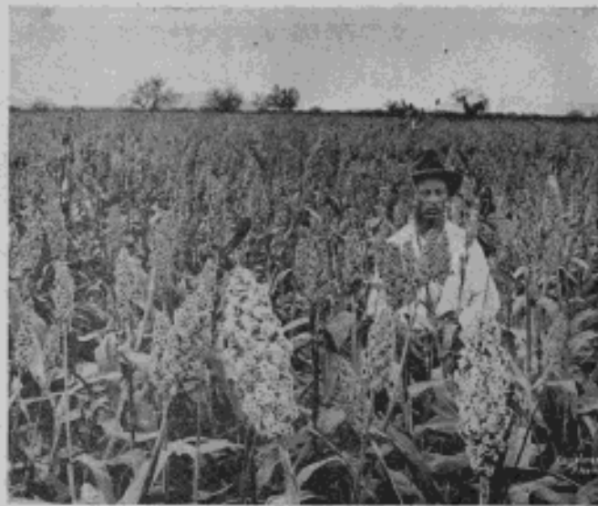
HEGARI IN THE VALLEY—THE DESERT JUST BEYOND

acres of fertile lands in the desert in Pinal County, Arizona.