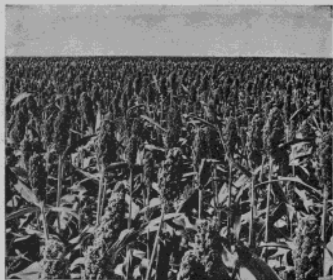
MILO MAIZE—A FIRST CROP ON NEW GROUND

Cantaloupes of the finest quality are multiple money makers. Lettuce is raised on an extensive scale at the Casa Grande end of the project, where the main line of the Southern Pacific makes for ease of shipping. Figs superior to the finest product of Smyrna can be grown in your back yard, and 1500 pounds of delightful dates have been taken from a single tree in the season. Apricots ripen weeks earlier than in California, while a careful strawberry grower can carry his market over months through a judicious selection of different maturing varieties, 14,000 three-quarter pound boxes having been produced on a single acre. Potatoes have recorded yields of 15,000 pounds, although their keeping quality is not equal to the northern grown tuber. Onions run between 5,000 and 20,000 pounds to the acre, with cabbage going to the 14,000 pound figure and tomatoes topping any of these totals!