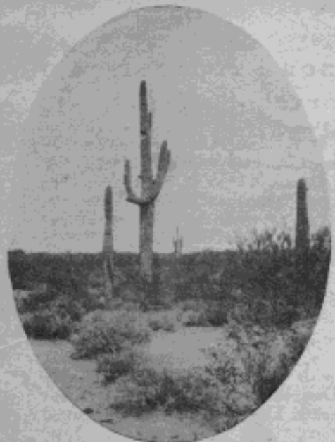
THE BLEAK DESERT