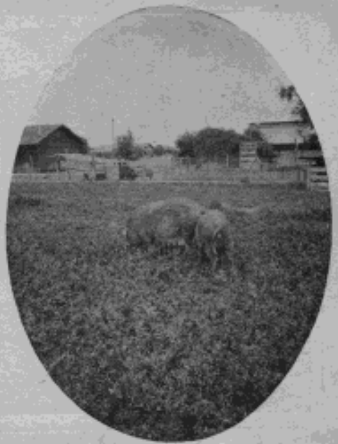
WHAT WATER DOES