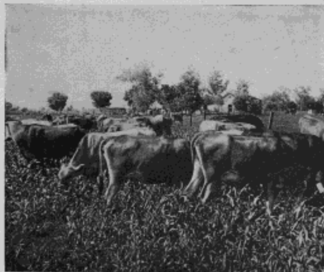
WHERE DAIRY STOCK ARE PASTURED THE YEAR ROUND

The San Carlos Project, as it is known at Washington, embraces that portion of the Gila (pronounced Hee-la) Valley, around Florence and Casa Grande, Arizona. It is de-