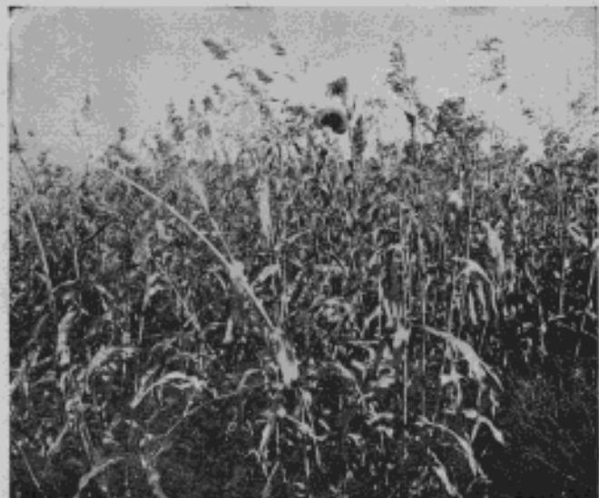
EIGHT FOOT SORGHUM

sired that the U. S. Reclamation Service build a storage dam in a Canyon near San Carlos, Arizona, which will save the flood waters of the Gila River, a waste that frequently amounts to more than 50,000 cubic feet the second! In 1905, the waters passing San Carlos measured enough to cover more than a million acres of land twelve inches deep, sufficient to insure bountiful crops on a half million of acres, could it have been stored and applied in that season! Stream measurements at San Carlos since 1914 show that more than a million acre-feet per year have wasted to the sea through the San Carlos damsite!