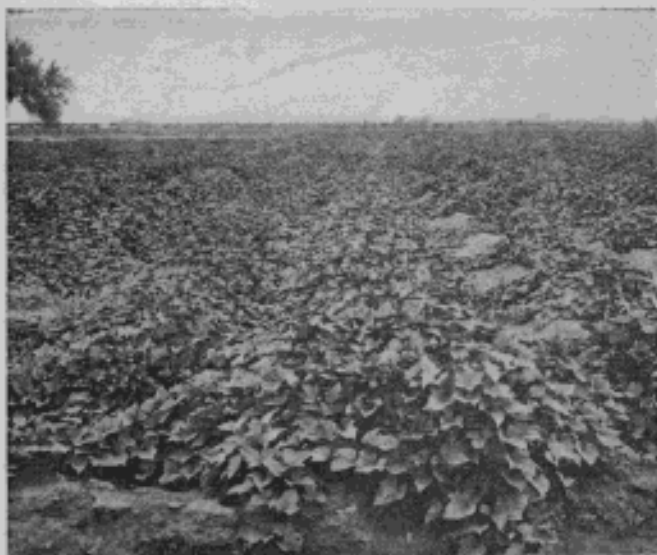
SWEET POTATOES PAY PROFITS

10 The lands within the Roosevelt Project in the Salt River Valley, not counting the