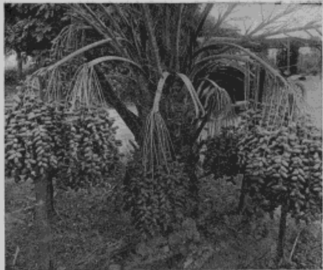
A LITTLE DATE TREE IN YOUR YARD

Fruits thrive in endless variety. Peaches mature from May to November. Boughs of strong trees break under the weight of prodigious pears, one of which exhibited in 1913 weighed 47 ounces! Arizona oranges, lemons and grapefruit top the New York market.