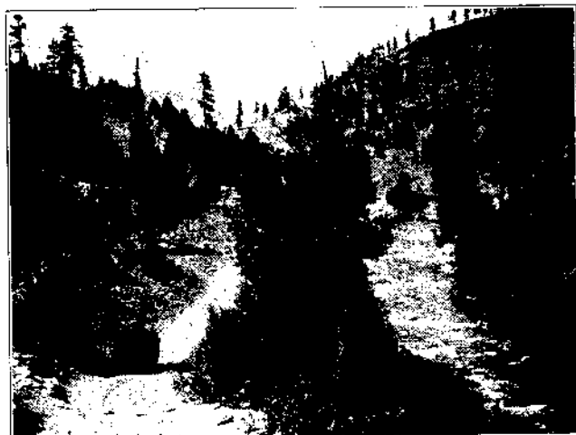
The road to the Upper Pecos in New Mexico is a notable scenic drive

In a setting that antedates Babylon, and under Moorish skies, La Ciudad Real de la Santa Fé de San Francisco (The City of