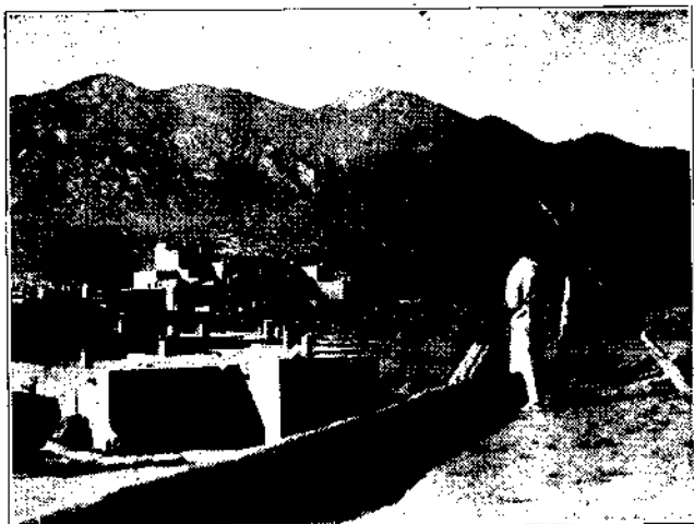
Taos Indian Pueblo, New Mexico

their fine old mission churches, and their narrow streets, give a foreign aspect to the scene. It is, indeed, a bit of Old Spain—with dark-eyed señoritas and señoras and swarthy caballeros, and ever the inevitable burro.