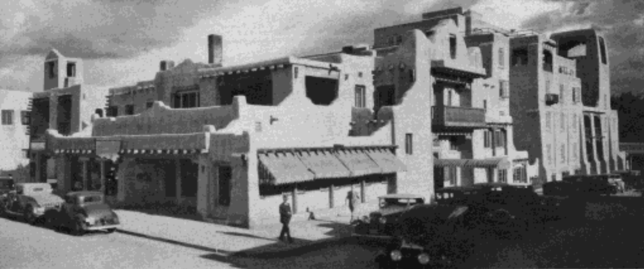
La Fonda Hotel, Old Santa Fe