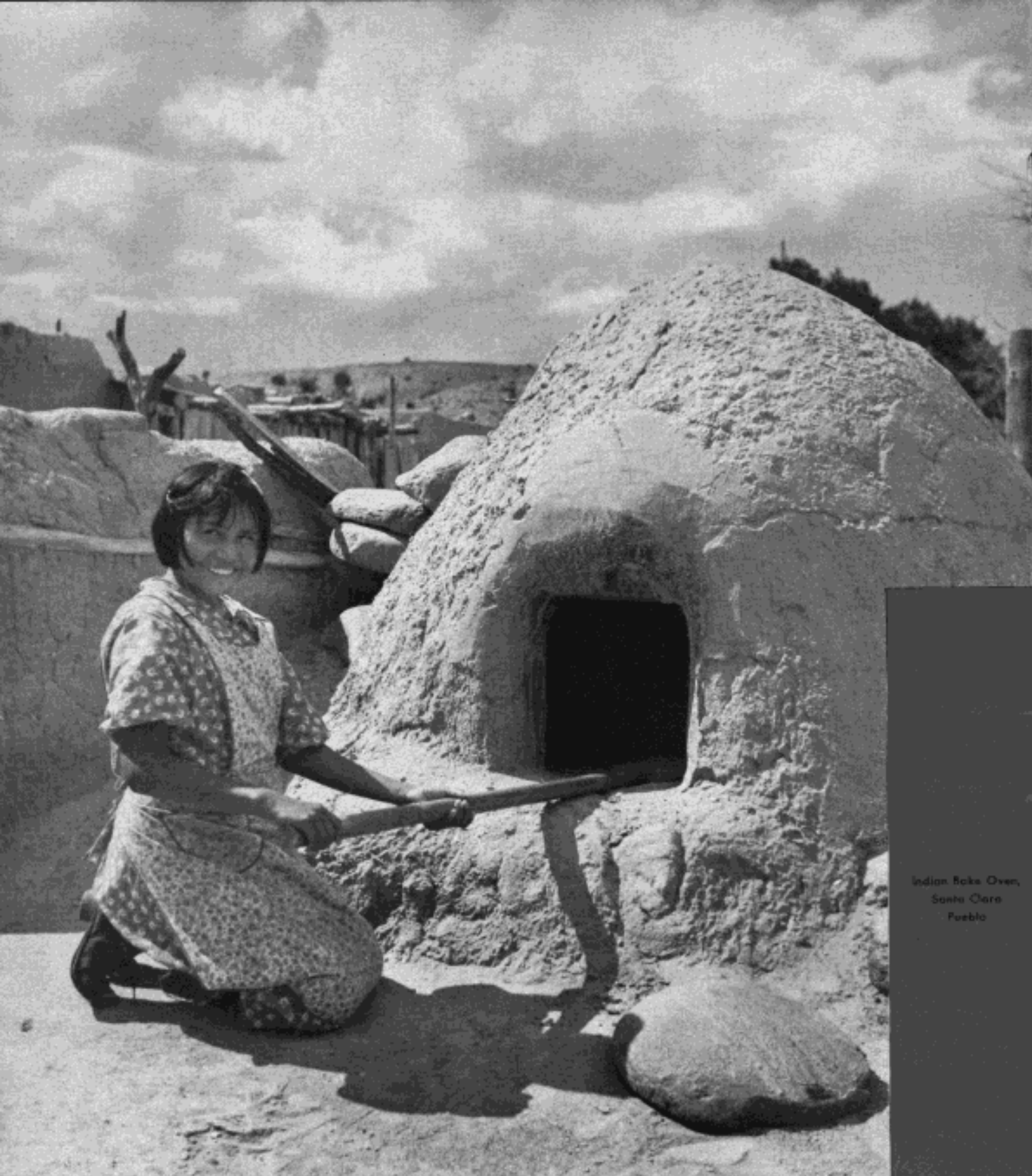
Indian Bake Oven, Santa Clara Pueblo