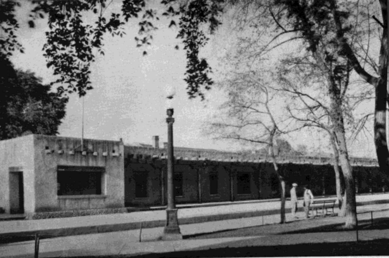
Old Palace of the Governors, Santa Fe

them to explore, unhurriedly, the age-old inhabited Indian pueblos and prehistoric cliff dwellings 'roundabout.