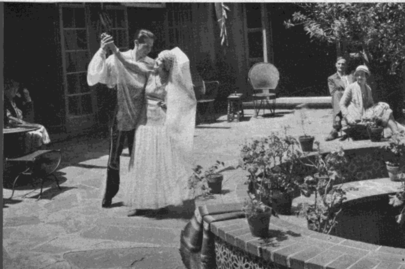
Entertainment at La Fonda Hotel