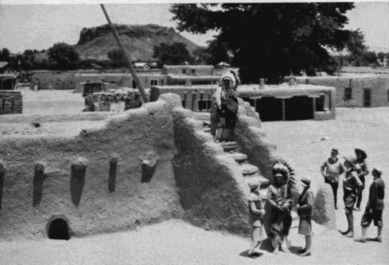
San Ildefonso, Indian Pueblo