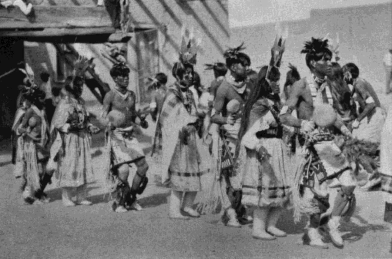
Indian Ceremonial Dance