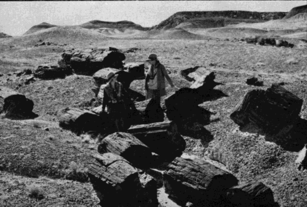
Canyon de Chelly, Arizona →