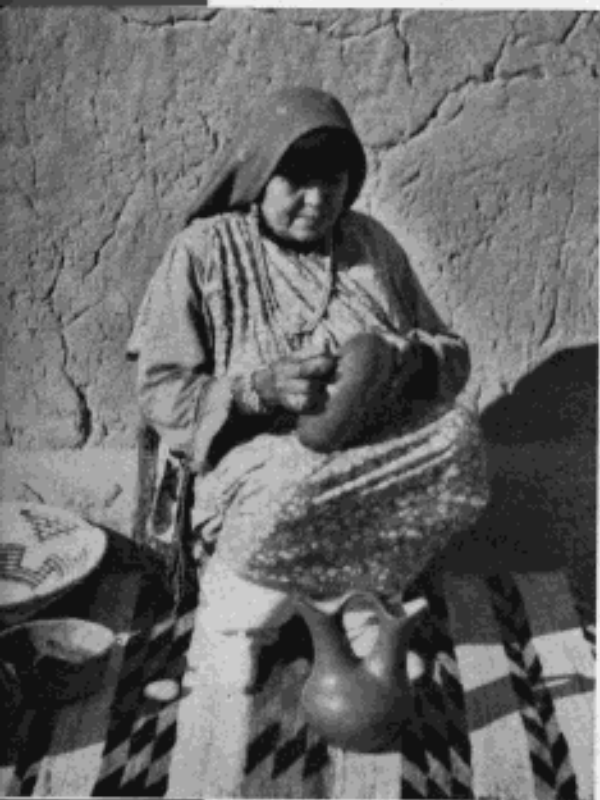
Pottery Maker at San Ildefonso Pueblo

MEALS —On the One-day Indian-detour, luncheon is taken at La Fonda, Santa Fé. On the Two-day and Three-day Detours, at La Fonda, Taos, and Inn in Frijoles Canyon. On the Tesuque Detour, all meals are taken at La Fonda.