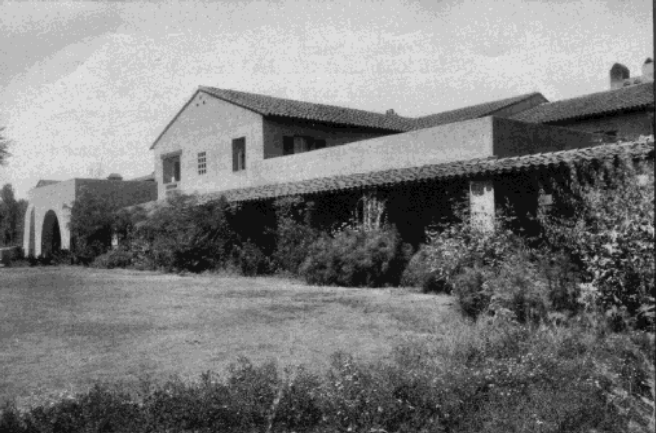
La Posada Hotel, Winslow, Arizona ←