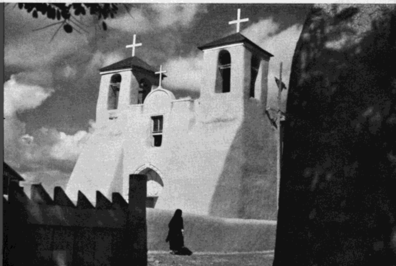
Rancho de Taos Mission, built in 1772