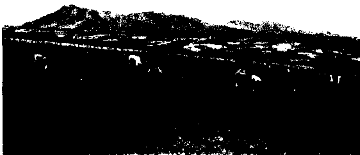
DAIRY CATTLE FEEDING ON ALFALFA

"All these communities are within easy reach of Tucson over three important lines of railroad: the main line of the Southern Pacific, the Southern Pacific of Mexico, running through one of the richest districts of Mexico, and touching tidewater at the important points, Guaymas and Mazatlan; and the El Paso and Southwestern System, of which Tucson is the present