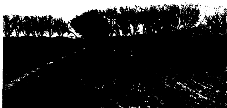
PLANTING EGYPTIAN LONG STAPLE COTTON AFTER CLEARING

"Dry land farming can be made profitable where there is a rainfall of twelve inches or more annually if they will adopt such drought-resisting plants as feterita and sorghums.