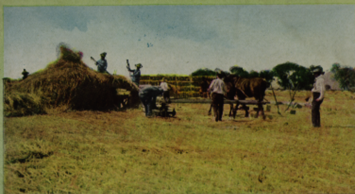
CUTTING AND BALING ALFALFA IN THE FIELD