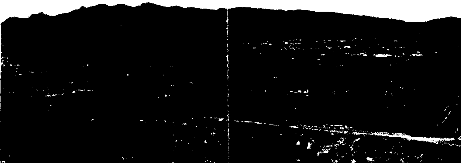
BIRD'S-EYE VIEW OF SANTA CRUZ VALLEY, NEAR TUCSON, WITH