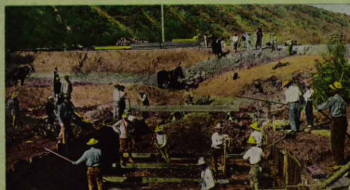
EXCAVATING AT HEAD WORKS OF TUCSON FARMS COMPANY