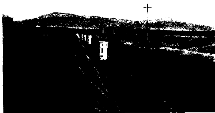
EIGHTEEN COMPLETED WELLS, UNIT NUMBER ONE

"Even then, there will be a heavy and ever-increasing demand on the part of the cities of