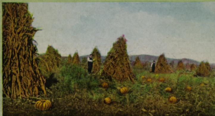
CORN PRODUCING 100 BUSHELS TO THE ACRE