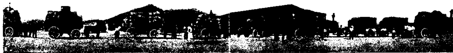
UNLOADING ALFALFA HAY AT WAREHOUSES—SIX TO EIGHT CROPS PRODUCED ANNUALLY