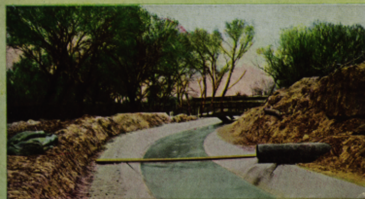
CARRYING THE WATER IN CEMENT DITCHES TO THE LAND